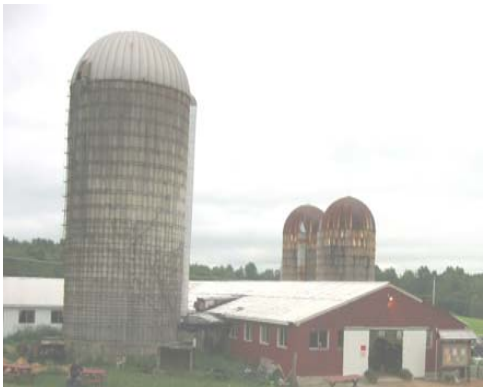
Educational Farm at Joppa Hill—Bedford

The Hillsborough County Conservation District (HCCD) represents soil and water conservation at the local level. Formed in 1946 as a legal sub-division of the State of New Hampshire, and operating under State Statute RSA 432:12, the District is directed by a Board of Supervisors who are state appointed, governing body of public officials comprised of five County residents who serve without pay.