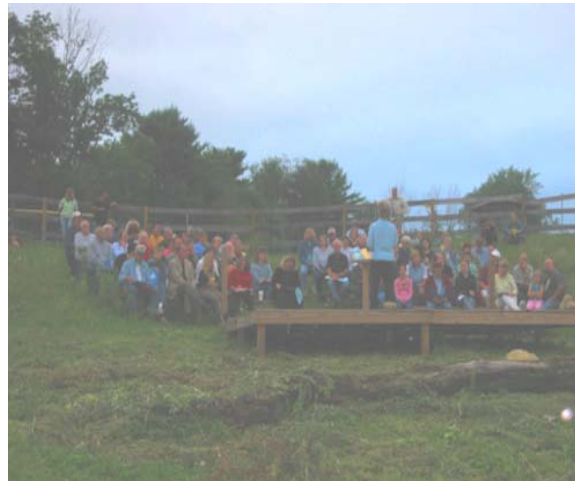
Horse BMP Workshop, August 2006

Soil Potential Index (SPI) Reports —A detailed agricultural soil evaluation is completed to assist landowners looking to put their land in current use or apply for easement funding. (A fee is charged)